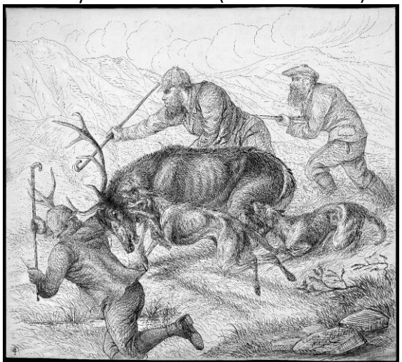
(Lot 15) Stag Picture Size 40 x 30cms