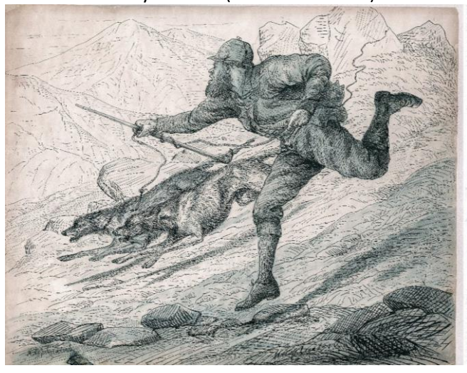
(Lot 11) Lying Hound Artist: Herbert Dicksee Size 82 x 52cms